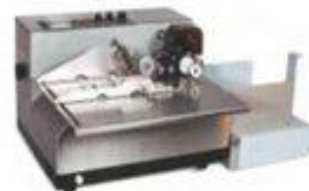
Dry Ink Coding Machine