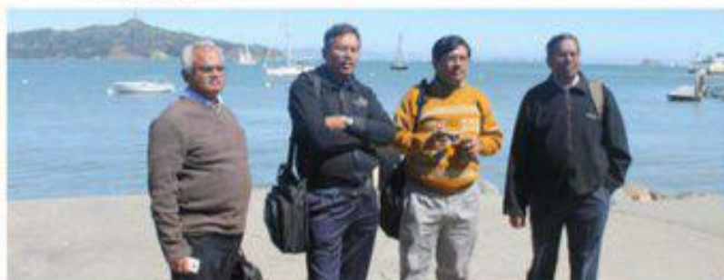
College Director and Professors in USA