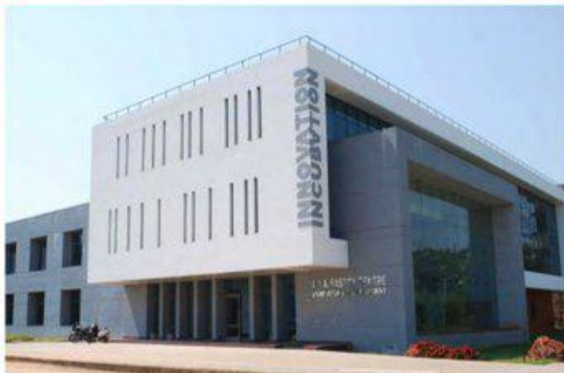
Dr. V.A. Sastry Centre for innovation and development