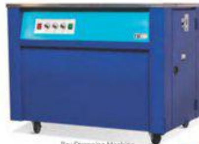
Box Strapping Machine