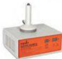
Portable Induction Sealer