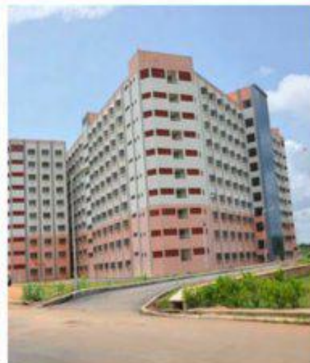
New Hostel Block for boys