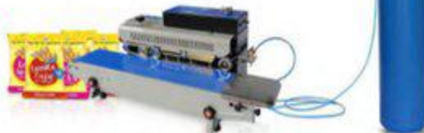
Gas Flushing Machine