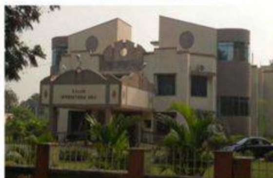
Kalam International Hall