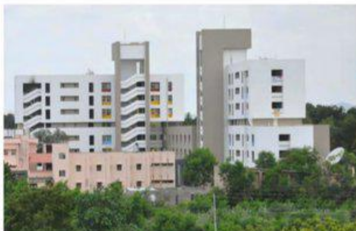
New Hostel Block for Girls